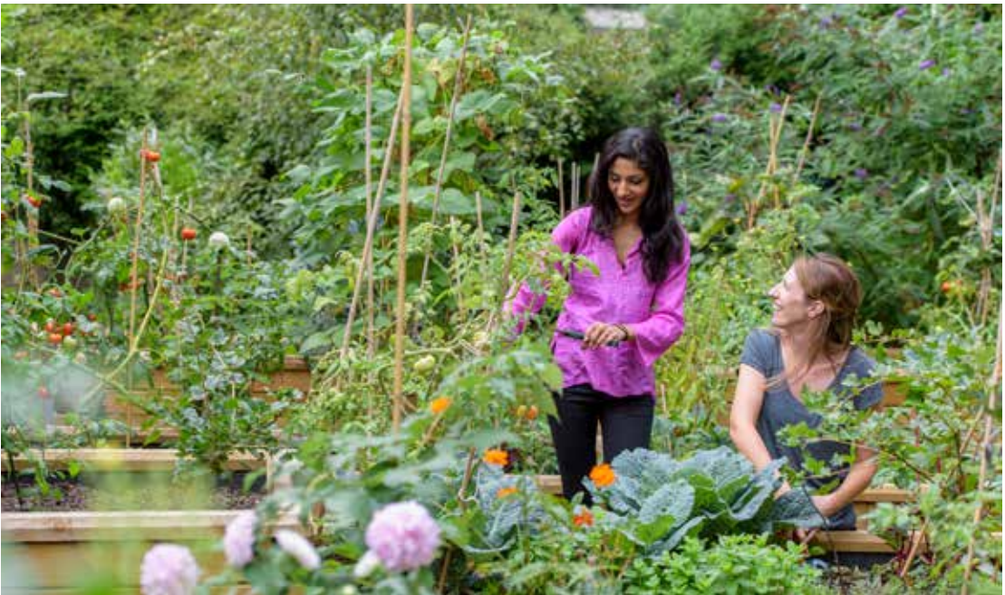
Allotments at the Golden Lane estate in London

What is more, people value places that feel authentic. Before they part with their money, they look for evidence of that authenticity. 3