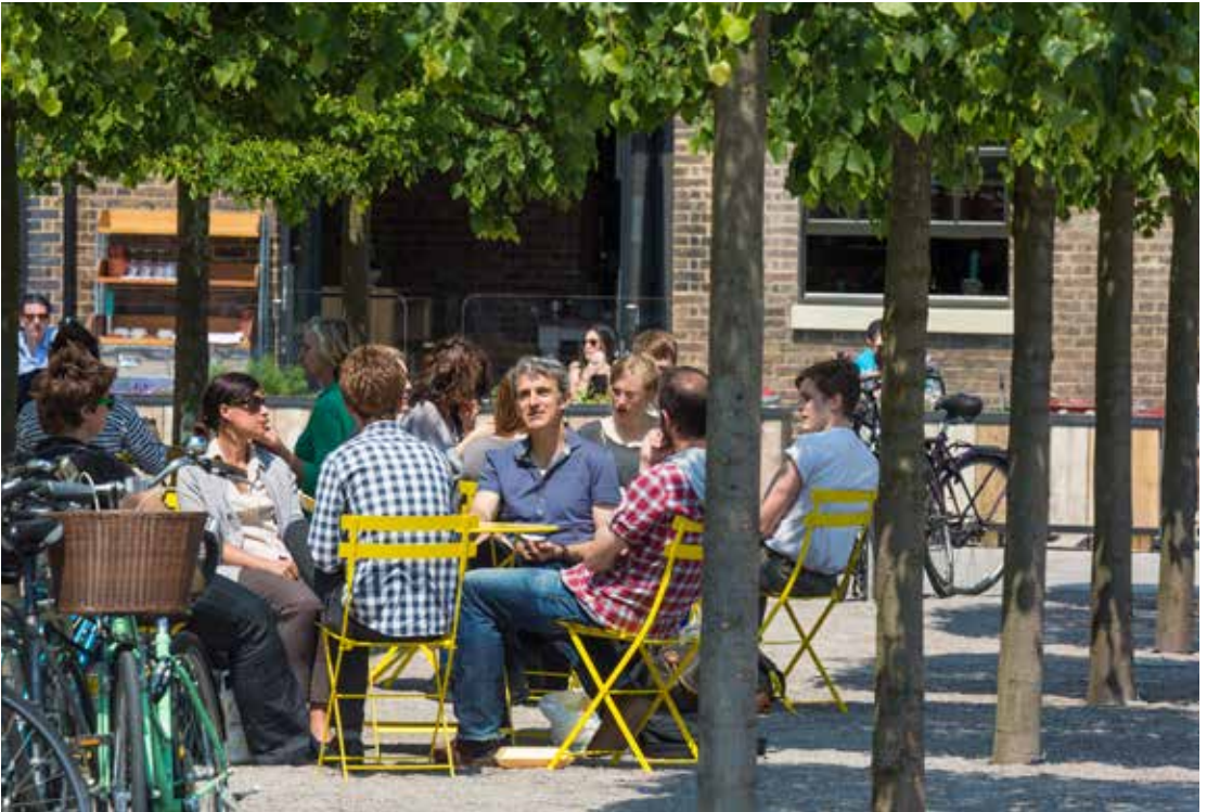
Granary Square, London

Safety is about more than well-lit walks and a convenient bike park: it is about being recognised and known. You feel safe in a place where you feel like you belong.